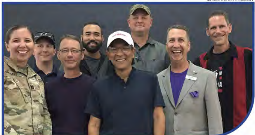
MAGICIANS ON A MISSION